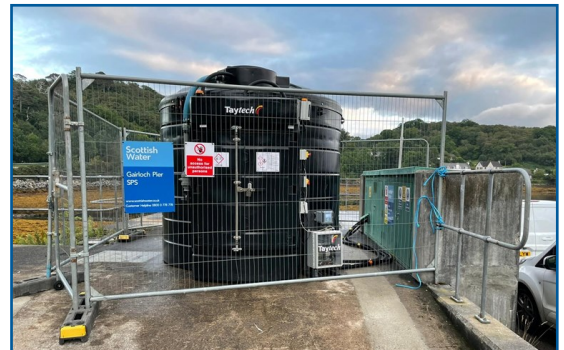
Temporary odour dosing system at Gairloch Pier Pumping Station

Members of the stakeholder group also raised concerns about odour experienced both at the WWTW site and from the sewer network. The performance data obtained at the WWTW in 2021 contributed to a fuller understanding of this. As a result, a temporary dosing system to address odour was installed at the Pier pumping station in September.